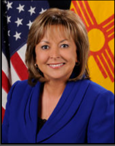
Message from Governor Susana Martinez