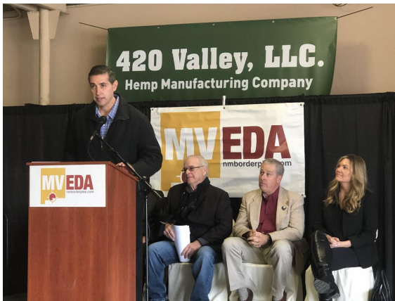
420 Valley Announcement

JABIL INC. – The a medical supply manufacturer headquartered in Florida, picked Albuquerque as its Center of Excellence for 3D printing. It will add 120 jobs with an average salary of $65,000.