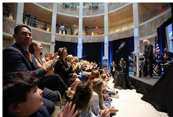
Virgin Galactic Announcement at the Roundhouse

At a major announcement in May , Virgin Galactic's Richard Branson came to Santa Fe to reveal that the company will relocate 120 employees to Spaceport America near Truth or Consequences to finish test flights and begin the first-ever commercial space service, expected in mid 2020.