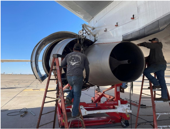
Existing customers are expanding their operations at CAVU Aerospace in Roswell.