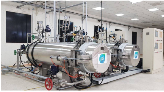
Fabric test and production pods at Green Theme Technologies