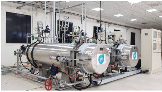
Fabric test and production pods at Green Theme Technologies