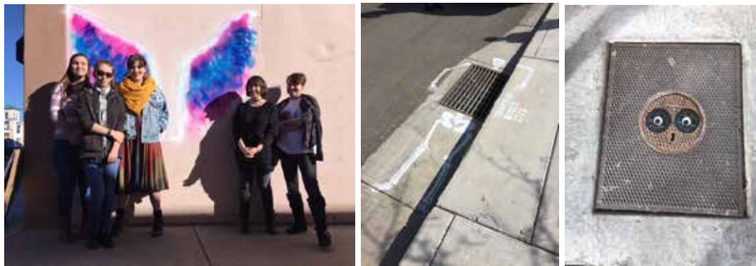
Temporary art additions in the district included the Angel Wings and Halloweekend chalk art installations