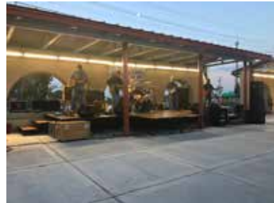
The Gate City Music Festival, Oktoberfest at Multi-Modal Parks supported growth of tourism and lodging revenues in Raton

Business development was a significant element of the ACD offerings; they partnered with the Raton Arts Council to allow new art entrepreneurs to use the RAHC's education building to hold entrepreneurship and arts classes. The group also held 2 recycled art camps for youth at the same location. The team also installed recycled tire flower pots were throughout the district.