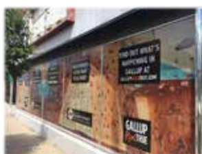
Vacant Building Window Wraps