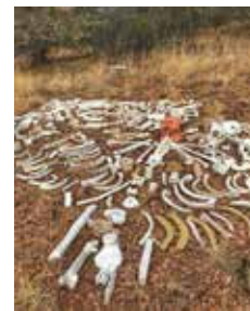
Clay art is central to Silver City ACD's efforts (l-r: Bowls for Hunger, Silvery City Clay Festival, and One Million Bones installation)

Silver City Arts & Cultural District hired a new director in 2017 and initiated comprehensive organizational development activities including a strategic planning process that culminates in early 2018. The organization has identified key strategies and goals through this process: