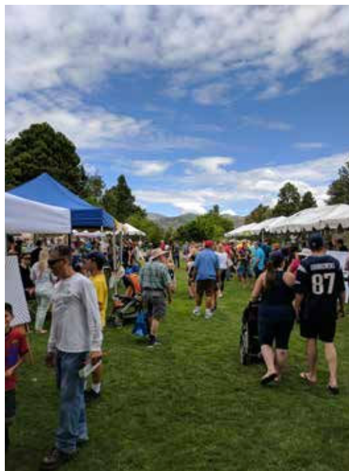
Los Alamos ScienceFest, with 15,000 attendees, was a significant economic support for area artists and art vendors