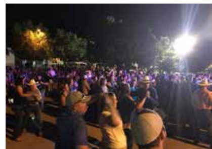
Red Dirt and Black Gold Festival