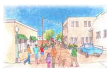
Alley Improvement Project