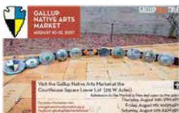
Native Arts Market Launched in August