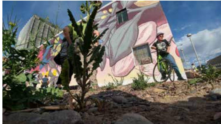
Mural Fest, a project of Warehouse 508 and the Maddox Co.

The group continues to convene Coffee + Creatives to facilitated economic development for creatives. Coffee + Creatives meets 2x/month for business owners, artists, and creatives to share resources, encourage partnerships, and discuss business strategies within the district. Downtown Albuquerque ACD cohosts Intro to First Fridays with Pacific Exhibits. These are mini-receptions/art showings at the Pacific Exhibits gallery on Gold St. The team also connect direct assistance and digital resources on current job/gig/funding opportunities to creative entrepreneurs.