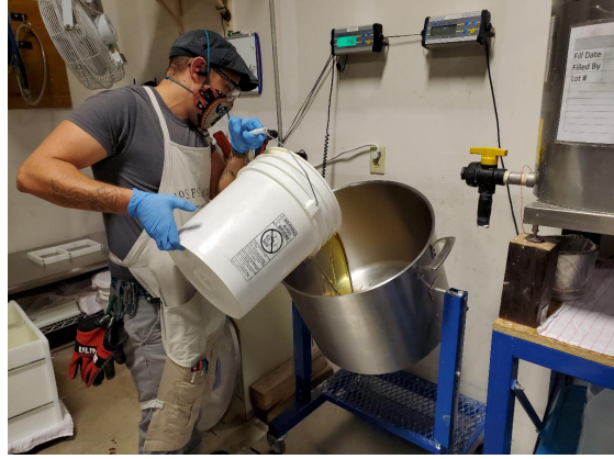
Los Poblanos Historic Inn and Organic Farm