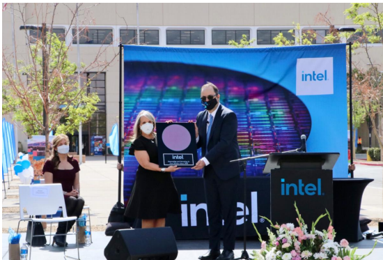
Gov. Lujan Grisham at the INTEL expansion announcement