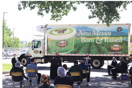
Gov. Lujan Grisham at the Bueno Foods