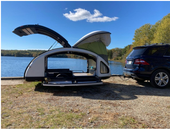
Earth Traveler Teardrop Trailers LLC