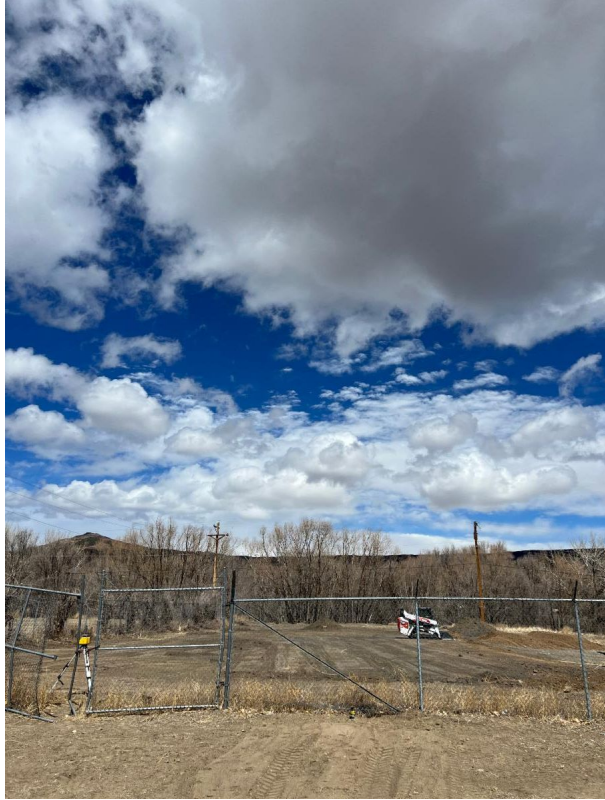
Ramel Family Farms greenhouse grading

The New Mexico Economic Development Department's mission is to improve the lives of New Mexico families by increasing economic opportunities and providing a place for businesses to thrive.