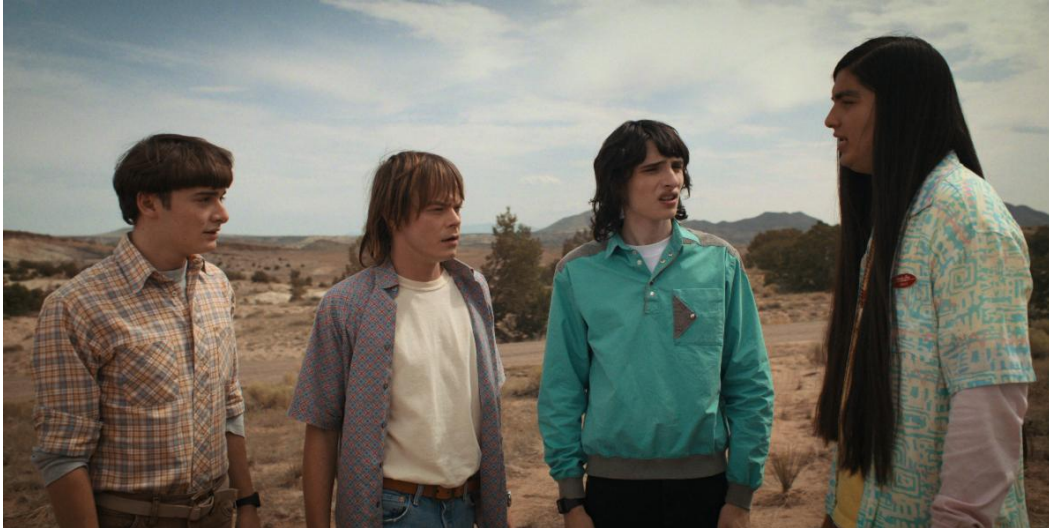
Netflix's "Stranger Things" Season 4 employed about 350 New Mexico crew members, 70 principal cast members, and 700 extras from the state.