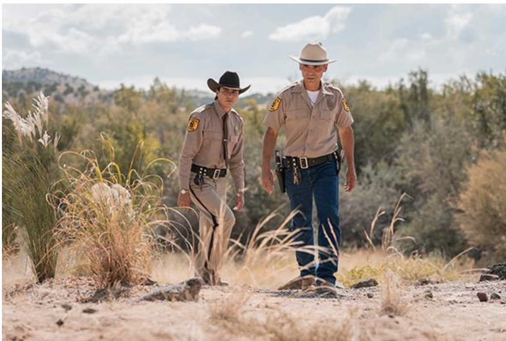
AMC Networks and Dark Winds Productions LLC's "Dark Winds" employed approximately 200 New Mexico crew members and more than 275 New Mexico background and extras.

The New Mexico Economic Development Department's (EDD) mission is to improve the lives of New Mexico families by increasing economic opportunities and providing a place for businesses to thrive. EDD's programs contribute directly to this mission by providing funding to train our workforce, providing infrastructure that supports business growth, and helping every community create a thriving economy. Since Jan. 1, 2019, EDD has supported more than 13,000 new jobs and trained 8,323 New Mexicans for better pay. EDD has utilized LEDA to make investments in 53 businesses, supporting more than 7,500 new jobs at an average wage of $70,000, $531 million in annual payroll, $5.2 billion in new capital investment, and a ten-year economic impact of $30+ billion. Thirty-nine communities across 22 counties have benefited from EDD programs.