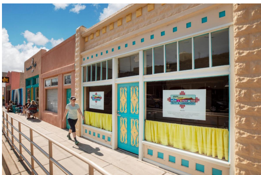
T or C MainStreet Office