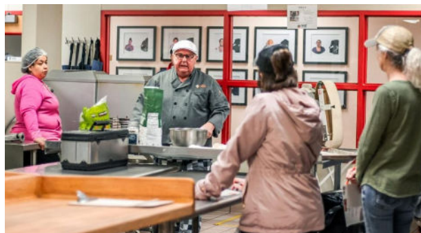
Baking Demonstration/Training at SVEDC

EDD's mission is to improve the lives of New Mexico families by increasing economic opportunities and providing a place for businesses to thrive. EDD's programs contribute directly to this mission by training our workforce, providing infrastructure that supports business growth, and helping every community create a thriving economy.