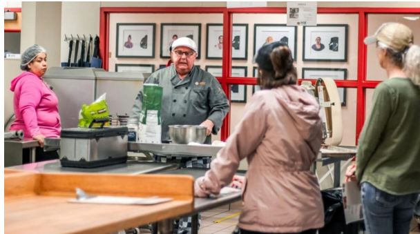
Baking Demonstration/Training at SVEDC

EDD's mission is to improve the lives of New Mexico families by increasing economic opportunities and providing a place for businesses to thrive. EDD's programs contribute directly to this mission by training our workforce, providing infrastructure that supports business growth, and helping every community create a thriving economy.