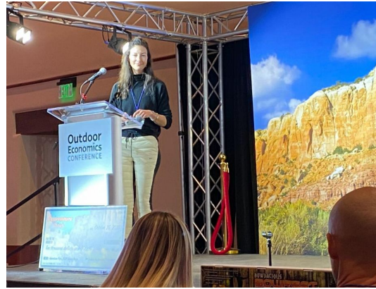
Adventure Pitch 3rd Place: Buttnski

The Outdoor Recreation Division, a division of the New Mexico Economic Development Department, aims to increase the overall mental and physical well-being of New Mexicans through the power of outdoor recreation, enabling residents throughout the state to hold jobs that afford them dignity, joy, and stability. We strive to commit to all residents to protect their state's natural heritage - its lands and waters, flora and fauna - and find a future on that path. We aim to parlay this commitment into long-term, sustainable investment, both in infrastructure and education.