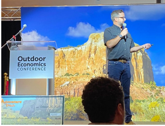
Adventure Pitch 2nd Place: GILZ