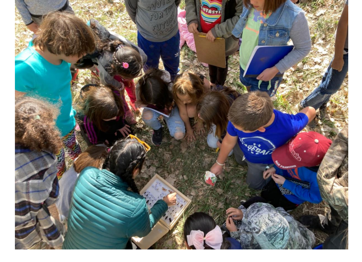
Bosque Ecosystem Monitoring Program