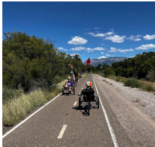
Day of the Tread Bike Race.