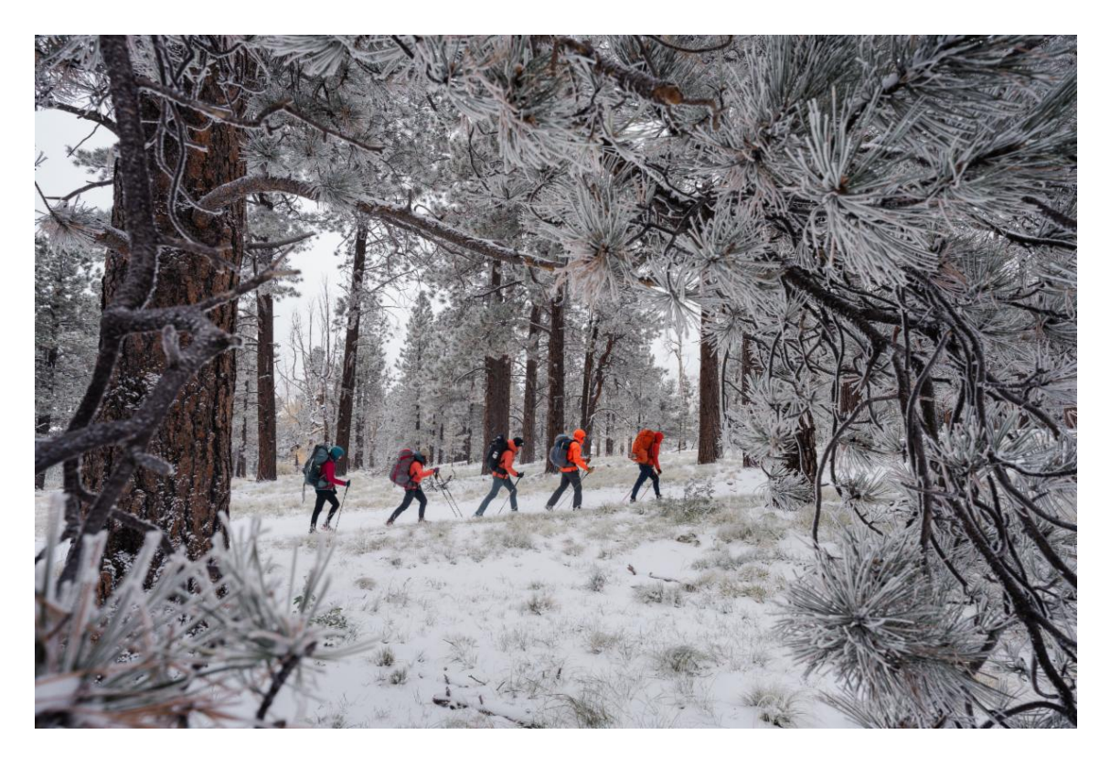
Participation in snow activities increased by 10%.

The Outdoor Recreation Division is a division of the New Mexico Economic Development Department. Its mission is to increase equitable access to the outdoors for all New Mexicans, ensuring healthy outcomes, environmental stewardship, and economic prosperity. For more information, visit <u>nmoutside.com</u> or follow us on <u>Facebook</u>, <u>LinkedIn</u>, <u>Twitter</u>, and <u>Instagram</u> @NMOutdoorRec.