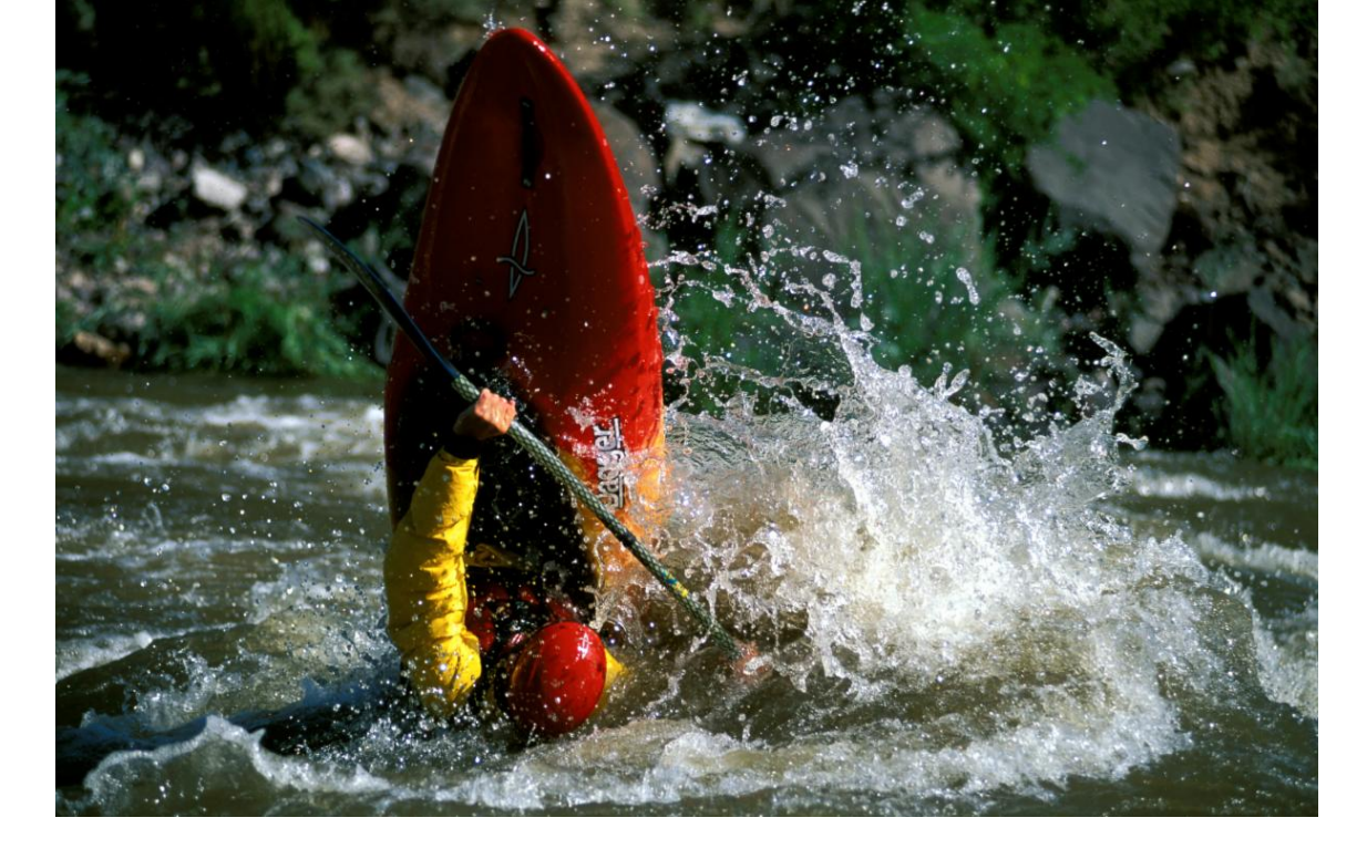
Canoeing and kayaking in the state has grown in popularity by 13% since 2022.