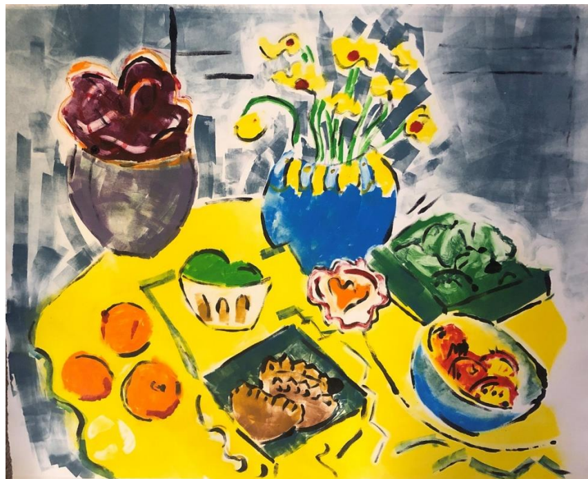
Print of Grandmother's Table by Julianna Kirwin