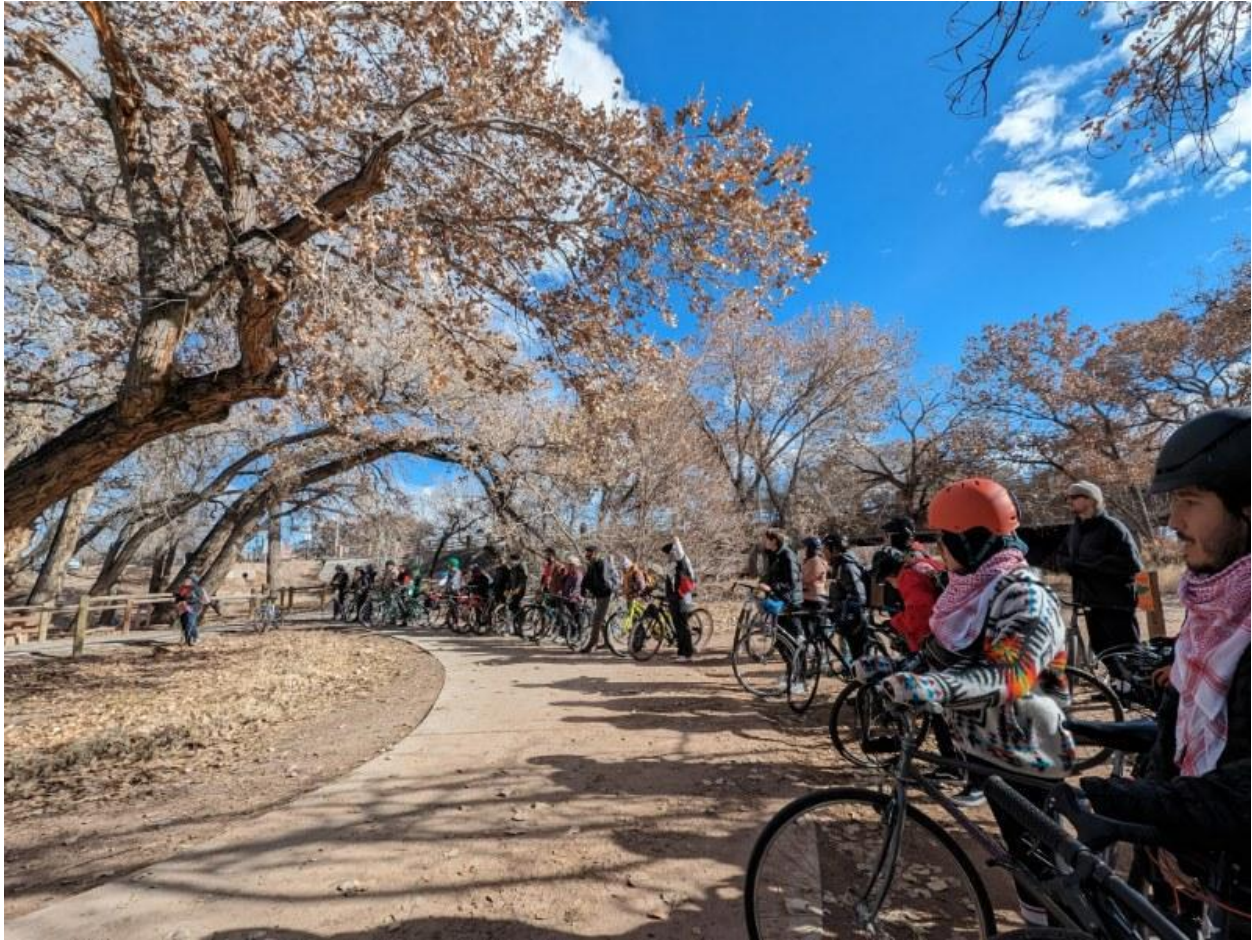
Landis Pulido works with StoryRiders during one of their bike rides