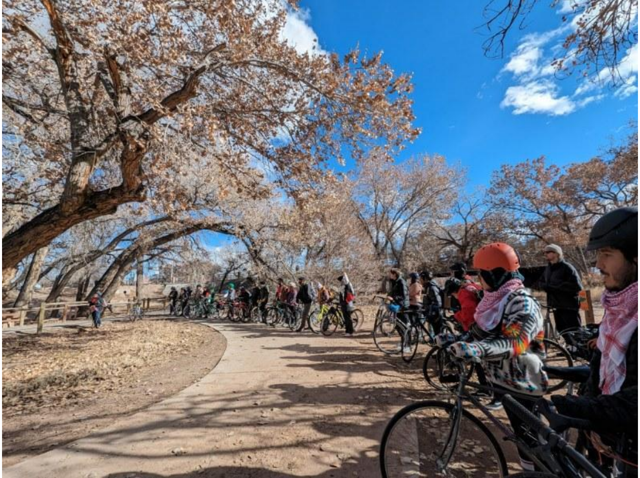
Landis Pulido works with StoryRiders during one of their bike rides