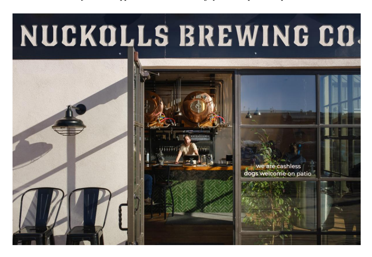
From construction to production, sustainability is what Nuckolls Brewing is all about. The Santa Fe location consists of a 3.5-barrel brewhouse and three 3.5-barrel fermenters, along with an established restaurant. This is their first JTIP application.