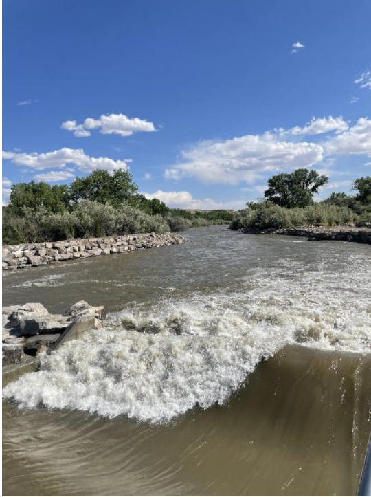
The City of Farmington is creating an adjustable wave feature in the Animas River at Gateway Park that also improves irrigation diversion and supports fish migration.