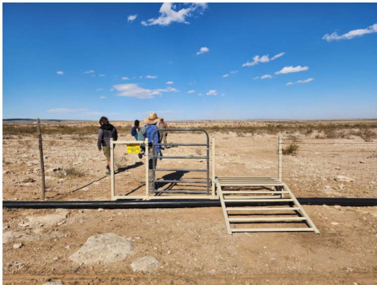
Cavern City Trail Keepers is installing 11 cattleguards and equestrian gates along the La Cueva Ridge Trail to connect the La Cueva Non-Motorized Trails System to the Guadalupe Ridge National Recreation Trail.

EDD's mission is to improve the lives of New Mexico families by increasing economic opportunities and providing a place for businesses to thrive. EDD's programs contribute directly to this mission by funding workforce training and infrastructure that supports business growth, helping every community create a thriving economy.