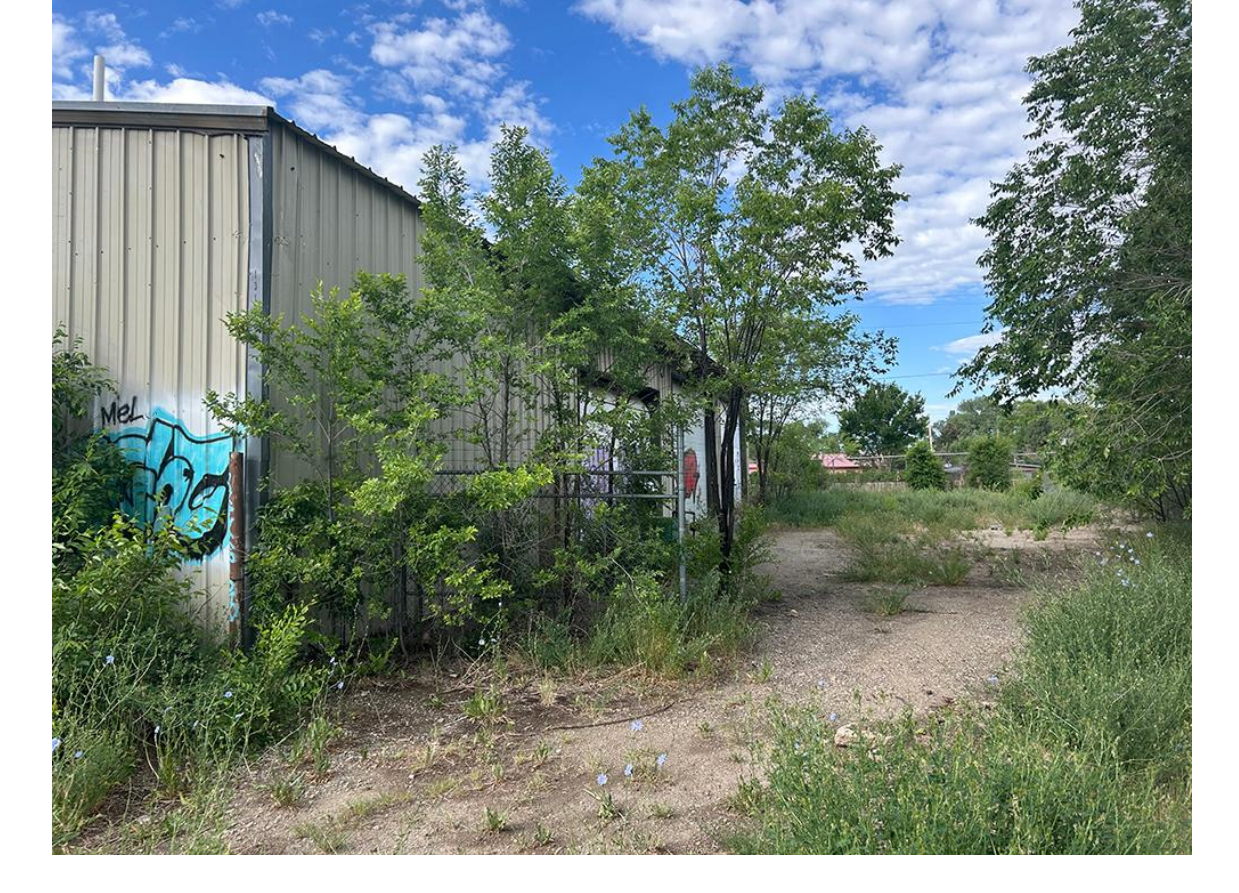
Abandoned warehouse purchased by Rolling Still for company expansion.

EDD's mission is to improve the lives of New Mexico families by increasing economic opportunities and providing a place for businesses to thrive. EDD's programs contribute directly to this mission by funding workforce training and infrastructure that supports business growth, helping every community create a thriving economy.